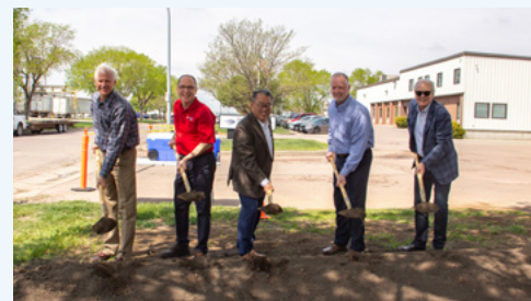
Electronic Systems Inc.