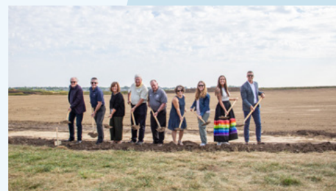
Northwest Elementary School