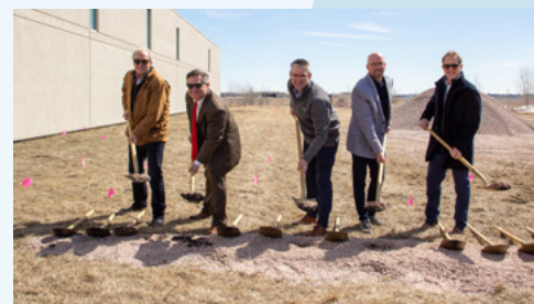
Huether Family Match Pointe Expansion