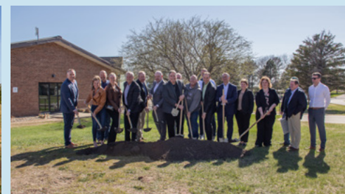
McCrossan School Addition & Renovation