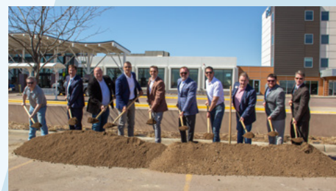
Sioux Falls Regional Airport Parking Ramp