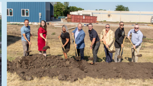
Glory House Apartments