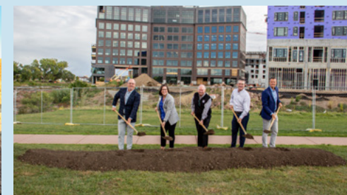
River Greenway Phase III