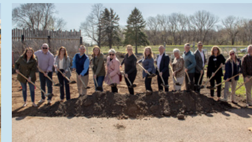
Great Plains Zoo Lions Exhibit