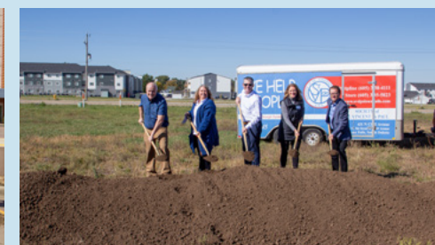
Society of St. Vincent de Paul