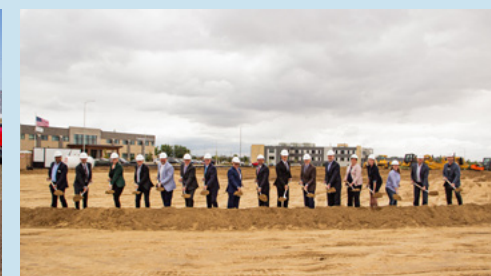
South Dakota One Stop