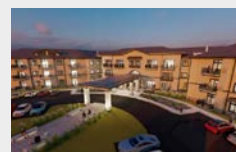
THE PARKWOOD COMMUNITY