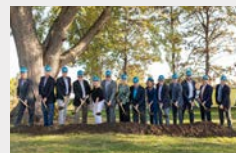
AUGUSTANA UNIVERSITY MIDCO ARENA