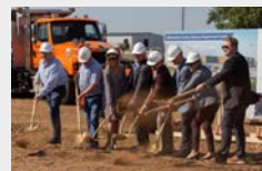
MINNEHAHA COUNTY HIGHWAY FACILITY