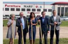
FURNITURE MART USA