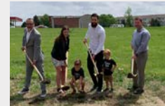
HIGHEST HEALTH CHIROPRACTIC