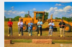
CHERRY CREEK CORRIDOR BIKE TRAIL