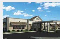
KIDS R KIDS LEARNING ACADEMY