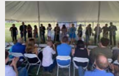
CALL TO FREEDOM