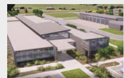
PUBLIC SAFETY TRAINING CAMPUS