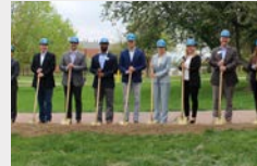
AUGUSTANA UNIVERSITY RESIDENCE HALL