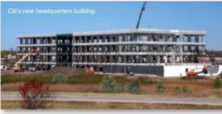
Citi's new headquarters building.

Citi started construction this spring on a 150,000 square foot, four-story facility on 19 acres in the Interstate Crossing Business Park at the junction of I-29 and I-229. Construction is scheduled to wrap up at the end of 2019.