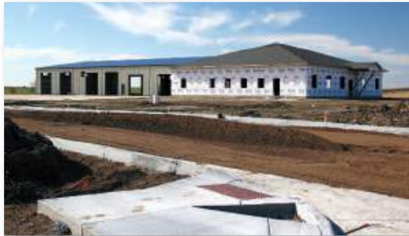
Street construction in Foundation Park and Dakota Carriers.