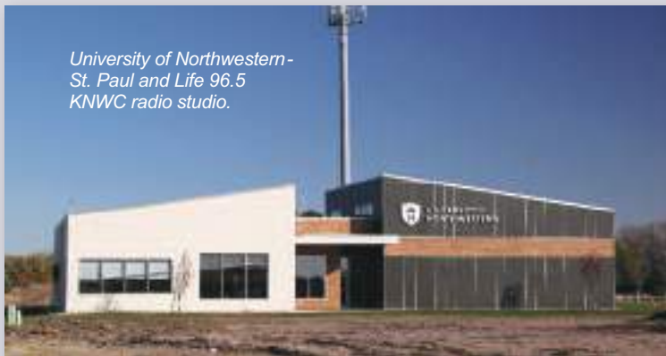
University of Northwestern - St. Paul and Life 96.5 KNWC radio studio.

Minnehaha County - $40M Jail expansion Sanford Sports Complex - Rugby field in partnership with Sioux Falls Parks & Rec; Summit League Conference headquarters SculptureWalk 2018 - 57 new outdoor sculptures exhibited throughout downtown Sioux Falls Sioux Falls Christian School - $1.5M, nine-classroom high school addition Sioux Falls Lutheran School - 72,000 square foot facility for PreK-8 Sioux Falls Regional Airport - $10M runway reconstruction; $5.5M baggage claim expansion South Dakota DOT - $55M I-90 & SD 100 Interchange South Dakota Public Broadcasting - New studio/office in Downtown Sioux Falls Stockyards Ag Exhibit - 3.63-acre, $4.1M development The Banquet - 7,000 square foot facility serving western Sioux Falls University of Northwestern-St. Paul/Life 96.5 KNWC - 6,000 square feet, combined distance and continuing education facility and studio for radio ministry Washington Pavilion - Kirby Science Discovery Center renovation Willow Run Golf Course - Revamp four holes