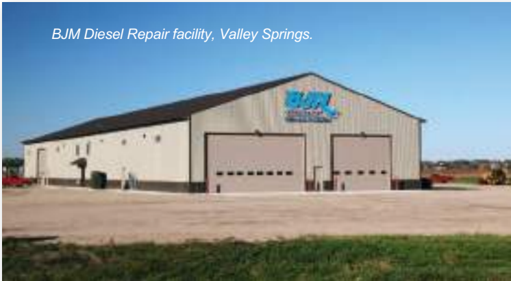
BJM Diesel Repair facility, Valley Springs.

BJM's new 17,280 square foot diesel mechanic shop on five acres in the Valley Springs industrial park was completed earlier this year.