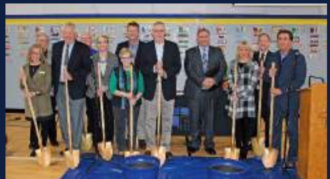
Sioux Falls Lutheran School 30-acre campus, October 11