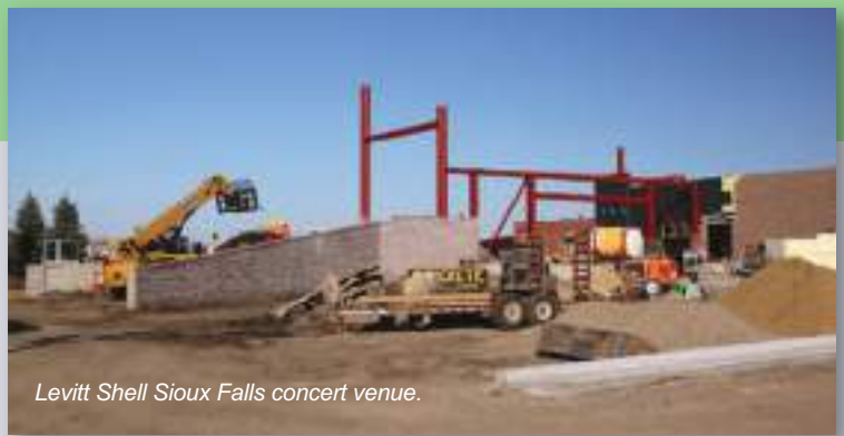
Levitt Shell Sioux Falls concert venue.

Arc of Dreams/Metli Plaza - $1.6M stainless steel sculpture that will span the Big Sioux River Augustana University - $3M upgrade to the Humanities Center City of Sioux Falls - $2.8M Administration Building; Water Reclamation Plant/sewer upgrades; $2.4M Rotary Park relocation/redevelopment; Bike Trail & Park improvements; numerous road improvement projects Dow Rummel Village - $30M, 88,500 square foot memory care and assisted living addition; expanded Main Street amenities and fellowship hall Great Plains Zoo - $2.5M brown bear exhibit renovation and expansion Irene Hall Museum Resource Center - $3.6M, 29,000 square foot archive facility by the City of Sioux Falls and Minnehaha County Levitt Shell - $4.6M outdoor performance venue at Falls Park West LifeScope - Rehabilitation center expansion