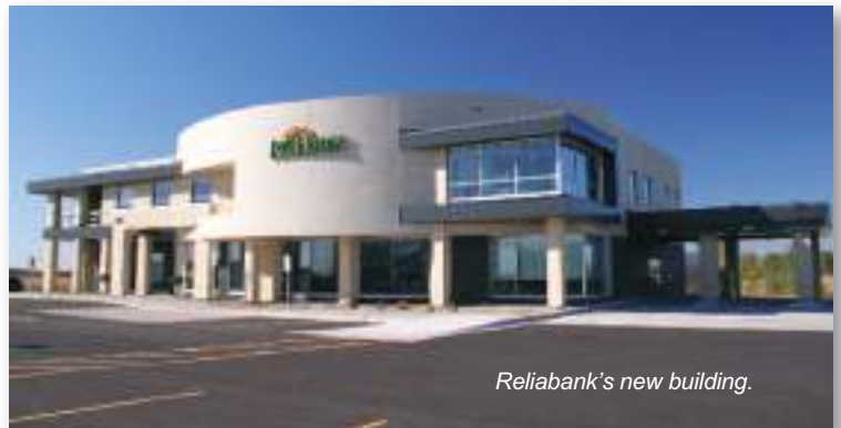
Reliabank's new building.

Power & Grace Gymnastics is another new addition to the Sanford Sports Complex. The 16,000 square foot two-story building represents a $1.5 million investment.