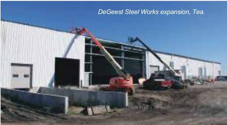
DeGeest Steel Works expansion, Tea.

Former Legacy Electronics space in Canton has transformed into a new venture called BLIMOR , a special purpose data center.