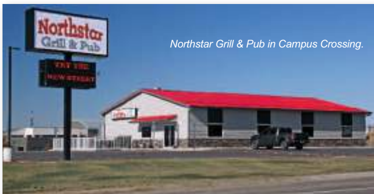
Northstar Grill & Pub in Campus Crossing.

Reliabank Dakota purchased land near 85th Street and Minnesota Avenue constructing a two-story, 14,960 square foot office building housing retail banking operations, a Raymond James investment office, insurance and mortgage departments. The $4.5 million facility opened in September of 2018.