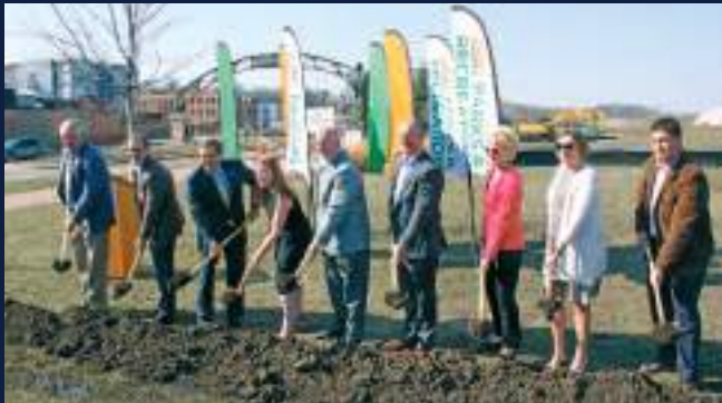
Levitt Shell Sioux Falls concert venue, April 23