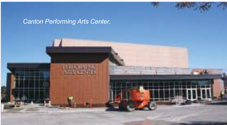
Canton Performing Arts Center.

Gate City Events added an 11-room hotel and campground with 20 RV sites to their 15-acre venue along Highway 18 in Canton. Facilities include a 1920s farmhouse that sleeps 24, an indoor pool and hot tub, and a converted building with event space for 400.