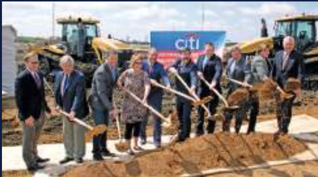
Citi office building, May 8