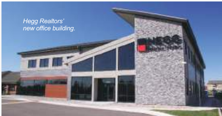
Hegg Realtors' new office building.

Lake Lorraine , a 130-acre development, is home to shoe retailer DSW, Inc. , a 10,000 square foot Kirkland's , and the new corporate headquarters Total Card Inc. The two-story, 40,000 square foot building can accommodate up to 400 employees. Including land, the facility is valued at $10 million. 32,000 square feet of retail space is being built next to Hobby Lobby, as well as another building along Marion Road that will include Capriotti's Sandwich Shop . Other new tenants within the development include Love Marlow women's clothing boutique, Van Buskirk Companies, Advanced Inc. , a growing medical staffing firm, and an Edward Jones office.