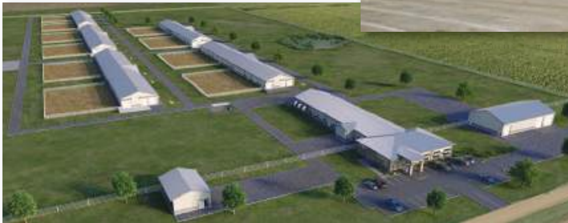
Rendering of SAB production Pharm upon completion.