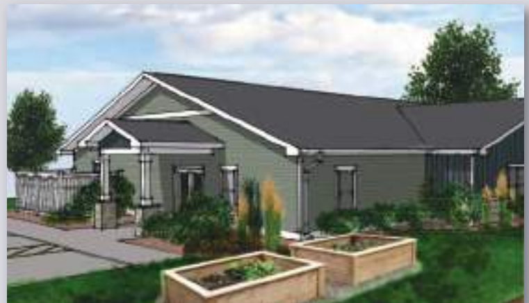
Rendering of Blue Dragon Academy daycare, Garretson.

Swenson Industrial Park & Sports Complex expansion (Hartford) The Bum Steer restaurant (Lennox) The Veranda by Meadow Bard (Harrisburg) White Barn Charm (Harrisburg)