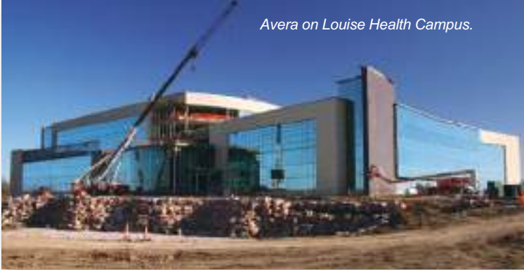
Avera on Louise Health Campus.

The 2.5-acre mixed-use Lloyd development in Uptown, named The Cascade , will include 20,000 square feet of commercial and office space, outdoor common space, underground parking and 200 residential units. The two-building, $43.5 million project is located between Phillips and Main Avenues, north of 3rd Street along the Phillips route. Completion is scheduled for spring of 2019. Commercial tenants will include Severance Brewing Co.