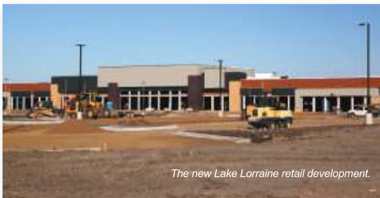
The new Lake Lorraine retail development.

The historic former bank building at the corner of 9th Street and Phillips Avenue is being refurbished into an upscale boutique hotel. The 92-room, independent Hotel Phillips is scheduled to open in early 2019.