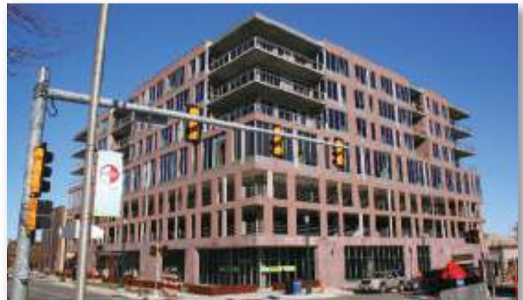
Washington Square mixed-use development.

The historic building at 600 East 7th Street is being restored and renovated to house Stone Group Architects . The former firehouse is undergoing a $1 million renovation.