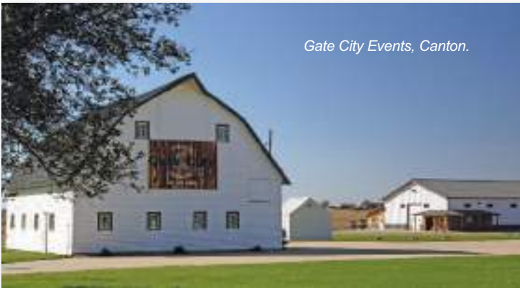
Gate City Events, Canton.

A new facility in Renner nearly doubles the warehouse space for Filly Flair , an expanding on-line clothing boutique retailer with a store attached to the warehouse.