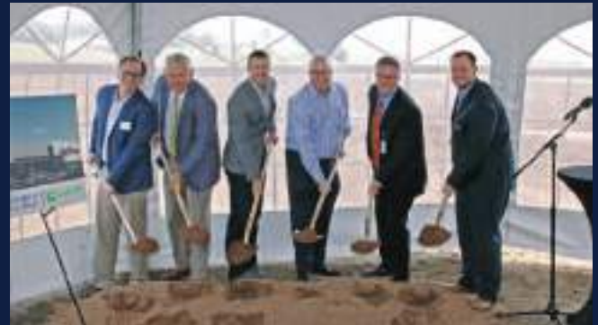
Mills Fleet Farm store, June 14