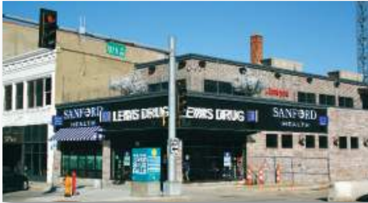
Lewis Drug store, downtown.

Lewis Drug anchors a 12,000 square foot building at 10th Street and Phillips Avenue in downtown Sioux Falls. Joining them in the development is Sanford Health with an acute care clinic Five with a 2,800 square foot second story addition and 3,200 square foot rooftop patio. Construction wrapped up in August of 2018. Additionally, a new 25,000 square foot Lewis Drug, attached to the new Sanford Clinic near 41st Street and Ellis Road, opened in September.