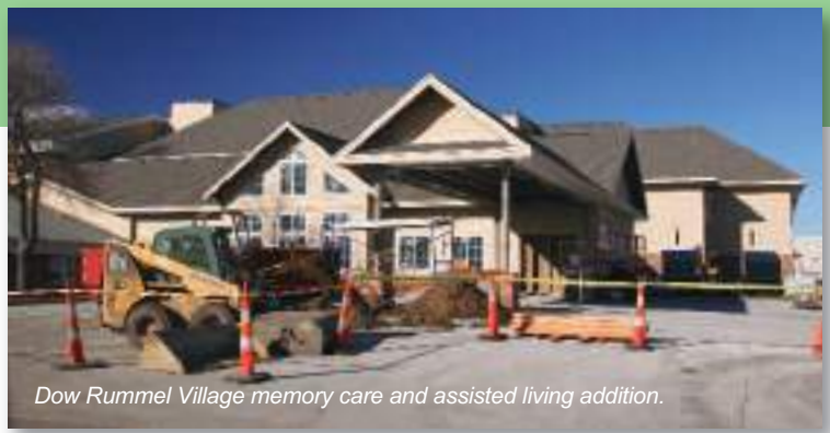
Dow Rummel Village memory care and assisted living addition.

Shop 'N Cart (West Avenue) Silverstar Car Wash (West 26th Street) Sioux Falls Audiology Associates (57th & Sycamore) Slim Chickens (Louise Avenue) Swamp Daddy's Cajun Kitchen (Downtown) Taco Johns (East 10th Street) Tawooki Mediterranean Chop Chop (41st Street) Thaw (Lakeside Drive) The Auto Group expansion (Minnesota Avenue) The First National Bank in Sioux Falls (South Louise Avenue) The Source Roaster & Taproom (Downtown) Tires Tires Tires (West 26th Street) Tre Ministries (33rd Street)