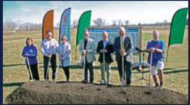
Parks and Recreation bike trail expansion, April 25