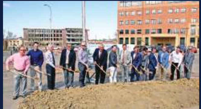
Village on the River mixed use facility, May 7