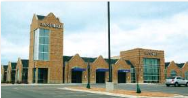
Sanford Health west side clinic.

The former Godfather's Pizza on East 10th Street was razed to make way for Security Savings Bank as they expanded services to Sioux Falls. The $1.9 million, two-story, 9,300 square foot Larchwood-based branch bank opened mid-2018.