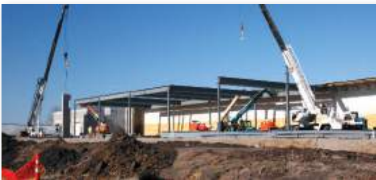
Graco plant expansion.

Minneapolis-based Graco is in the process of adding 56,000 square feet to their facility located in Sioux Empire Development Park III at 3501 North Fourth Avenue. The expansion is expected to create 40 new jobs over the next four years and be operational in April of 2019.