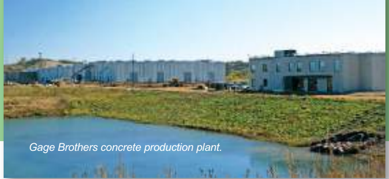
Gage Brothers concrete production plant.

Agan Drywall purchased the former I-29 Brick property 2605 South Carolyn Avenue for expansion purposes.