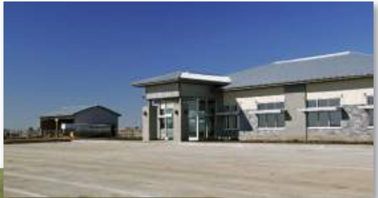
SAB Pharm, Canton.

A ribbon cutting ceremony for the initial phase of the Lincoln County project took place October 30. Phase includes a four-building complex with a total footprint approximately 40,000 square feet and six full-time