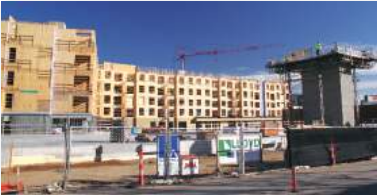
The Cascade development in the Uptown area.

Goosmann Law Firm will be the first tenant in the new Prairie Hills Galleria mixed-use development at 69th Street and Western Avenue. The two-story, 25,000 square foot facility is scheduled to open in late spring of 2019.