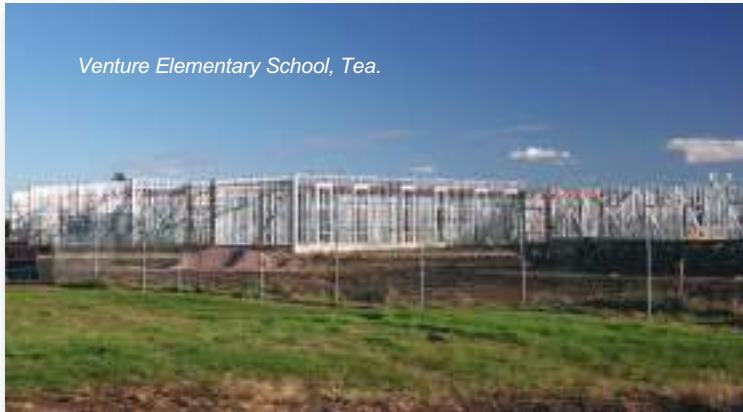
Venture Elementary School, Tea.

The first phase of grading and utility infrastructure has been completed at Revang Industrial Park . This 80-acre development represents the sixth industrial park in Brandon.