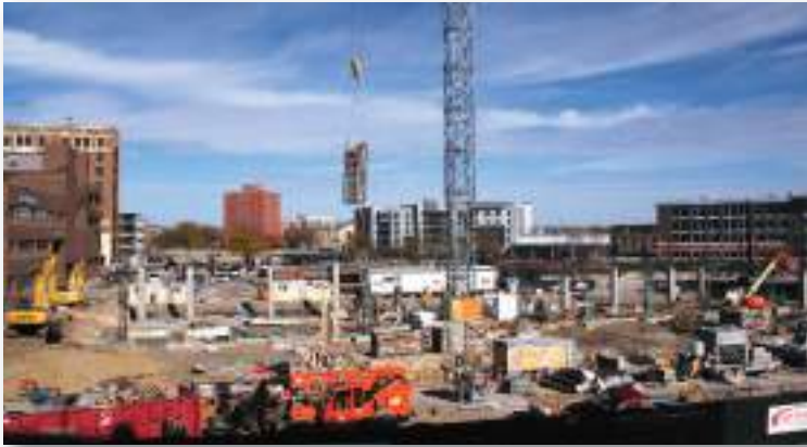
The 15-story Village on the River development.

Residence Inn and AC Hotel by Marriott are part of the 15-story, $50 million, mixed-use Village on the River development under construction in downtown Sioux Falls. With 220 rooms between the brands and shared amenities, the development will also feature retail facilities and a city-owned parking ramp.