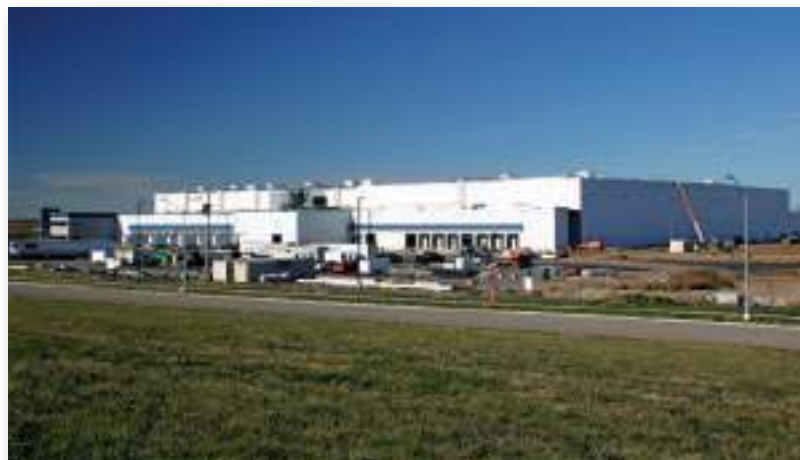
Phase II at the Win Chill facility in Foundation Park.