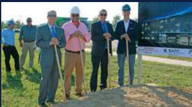
GLo Hotel, September 12