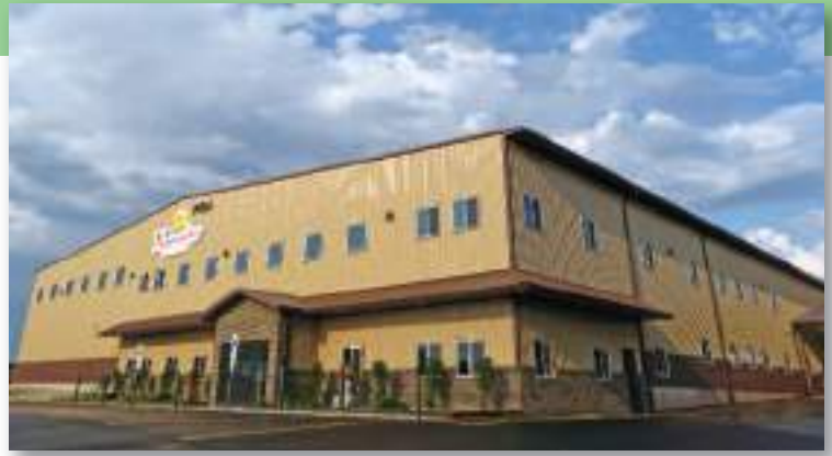
Nordstrom Automotive 2.0 Next Generation facility, near Garretson.

Construction wrapped-up on Nordstrom Automotive 2.0 Next Generation facility in rural Garretson. The company celebrated the opening of the 60,000 square foot facility in September.