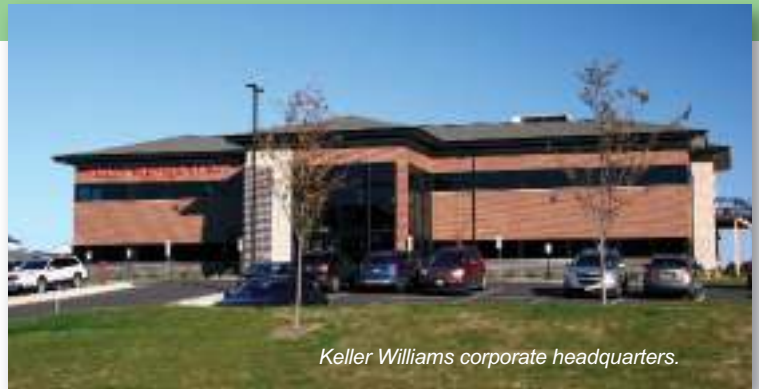
Keller Williams corporate headquarters.

Harr-Lemme built a new facility to house their real estate and development businesses. The $1.3+ million building located on the southwest corner of South Dakota 100 East 41st Street, adjacent to Harmodon Park.